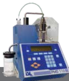
PMD 110 Micro Distillation Analyzer