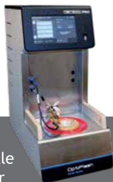
OptiFlash Small Scale Flash Point Analyzer