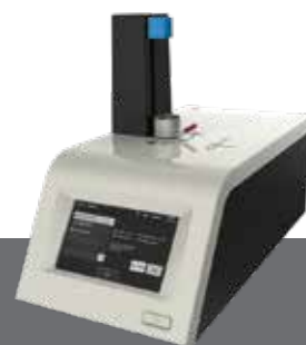
VIDA Density Meter