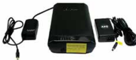
High-performance lithium ion battery with power supply