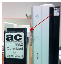
Figure 2: 7693A ALS Optimized for Light Solvents

The Inlet Fan on the GC was replaced with a higher capacity model, and the 7693 ALS was equipped with an additional fan providing significant vertical airflow, diverting heat away from the sample area.