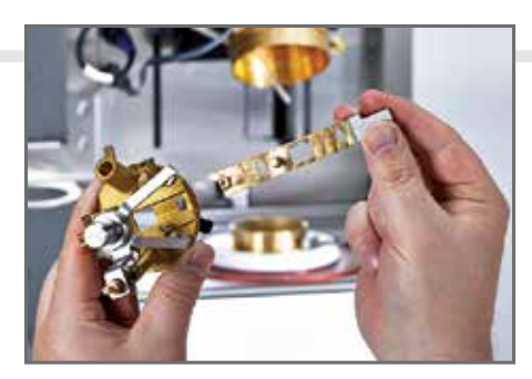
Easy disconnection, for easy and external cleaning of the cup-cover