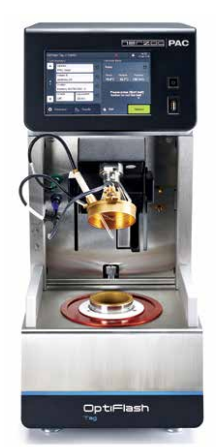
Tag model without stirrer