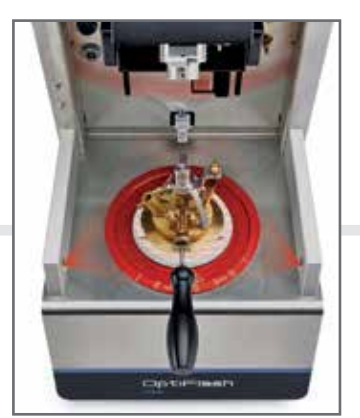
Optical fire detecting system covers entire hot area