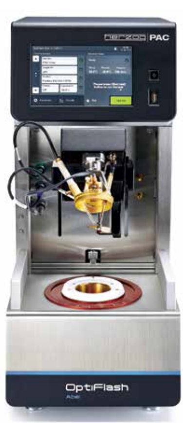
Abel model with stirrer