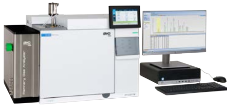
AC Hi-Speed Refinery Gas Analyzer