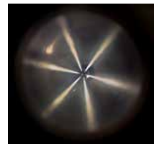
CAD drawing of probe installation and photograph of n-heptane spray within the chamber of the CID 510